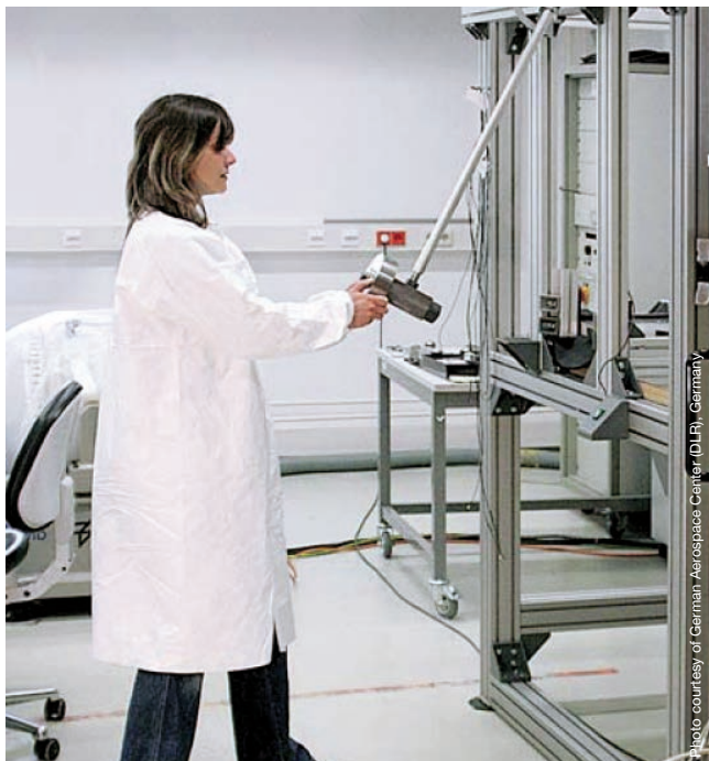
Shock Response Spectrum testing using an impact hammer