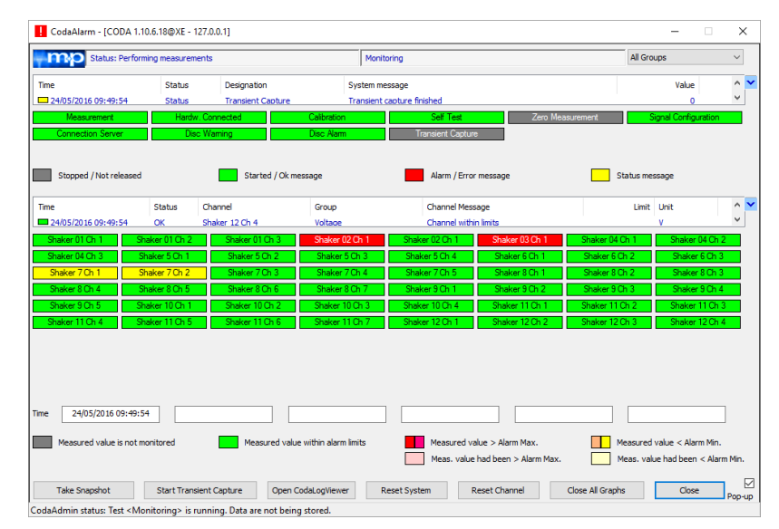
ABOVE: Full-featured limit checking and alarm monitoring

As mentioned, the signals acquired and monitored can be of any type and types can be mixed using one of the different types of measurement hardware. Also, sampling rates may be user-defined and can vary per channel. The available signal types are: acceleration, displacement, pressure, temperature, DC values, strain, force, current, gas flow and electrostatic radiation. Any electrical signal, from any kind of sensor whatsoever, may be monitored to guarantee the safety of the test article or the test equipment performing the vibration test. The SQL database structure of the m+p Coda software allows for this mixing of signals as well as the ability to create groups of data. This grouping function also allows for filtering by measurement type or measurement hardware, making data management for mixed signals simple and easy. The unique feature of m+p Coda is this capability of monitoring and triggering