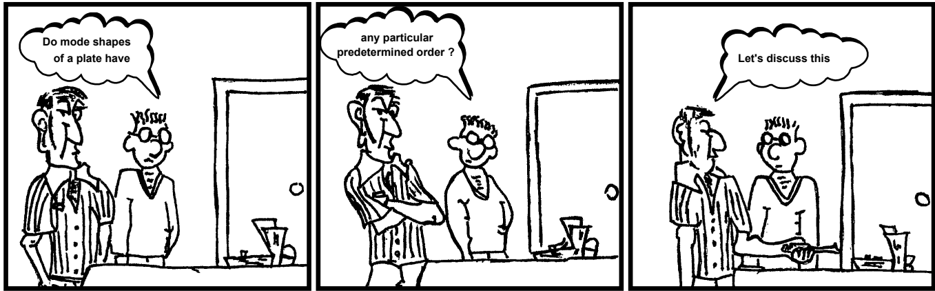
Illustration by Mike Avitabile

Do mode shapes of a plate have any particular predetermined order? Let's discuss this.