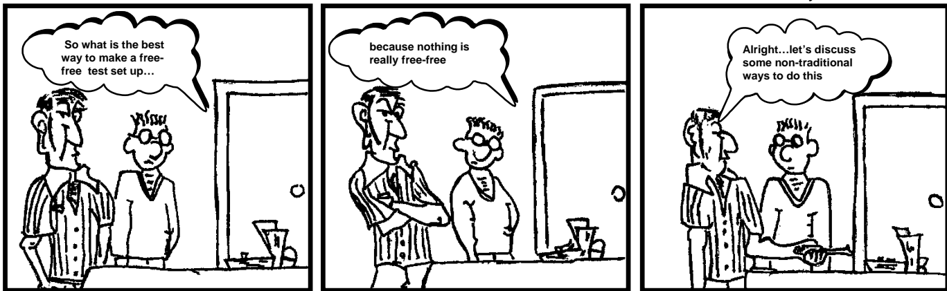
Illustration by Mike Avitabile

So what is the best way to make a free-free test set up ... because nothing is really free-free. Alright ... let's discuss some non-traditional ways to do this.