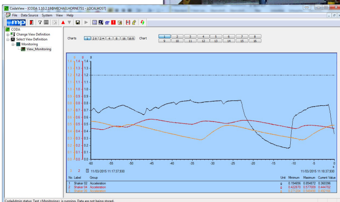
Monitoring of vibration tests