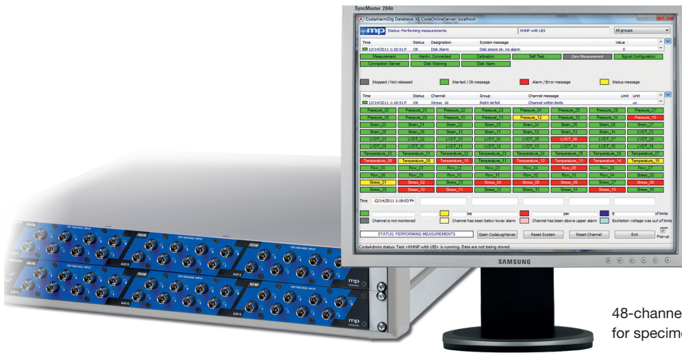
48-channel m+p Coda monitoring system for specimen protection

Our customer, a US-American spacecraft manufacturer, was upgrading an out-dated analog system. They chose the m+p Coda system for their multi-channel specimen protection system. The system they configured is a 48-channel system based on the m+p VibRunner acquisition hardware. The m+p Coda software allows the test engineers to set alarm limits for test shutdown on any of the 48 channels, sampled at up to 102.4 kHz. A digital relay system connects the m+p Coda system to the power amplifiers and the vibration control system. A combination of acceleration and strain signals are monitored for specimen protection.